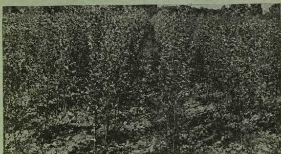
(Block of 2 yr. Apples)